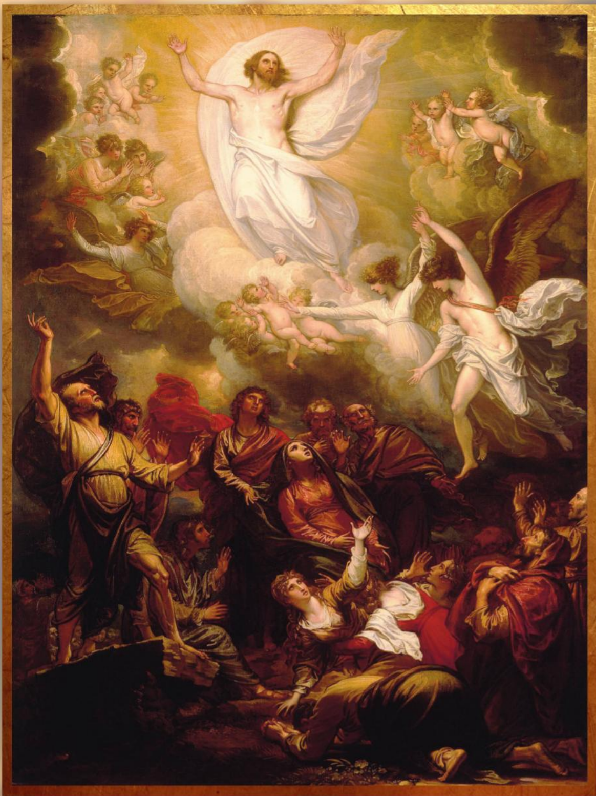
Ascension of the Lord