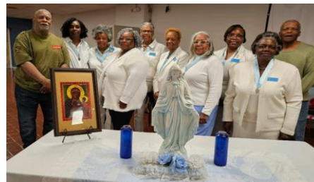
(Sodality members photo – April 7, 2024)